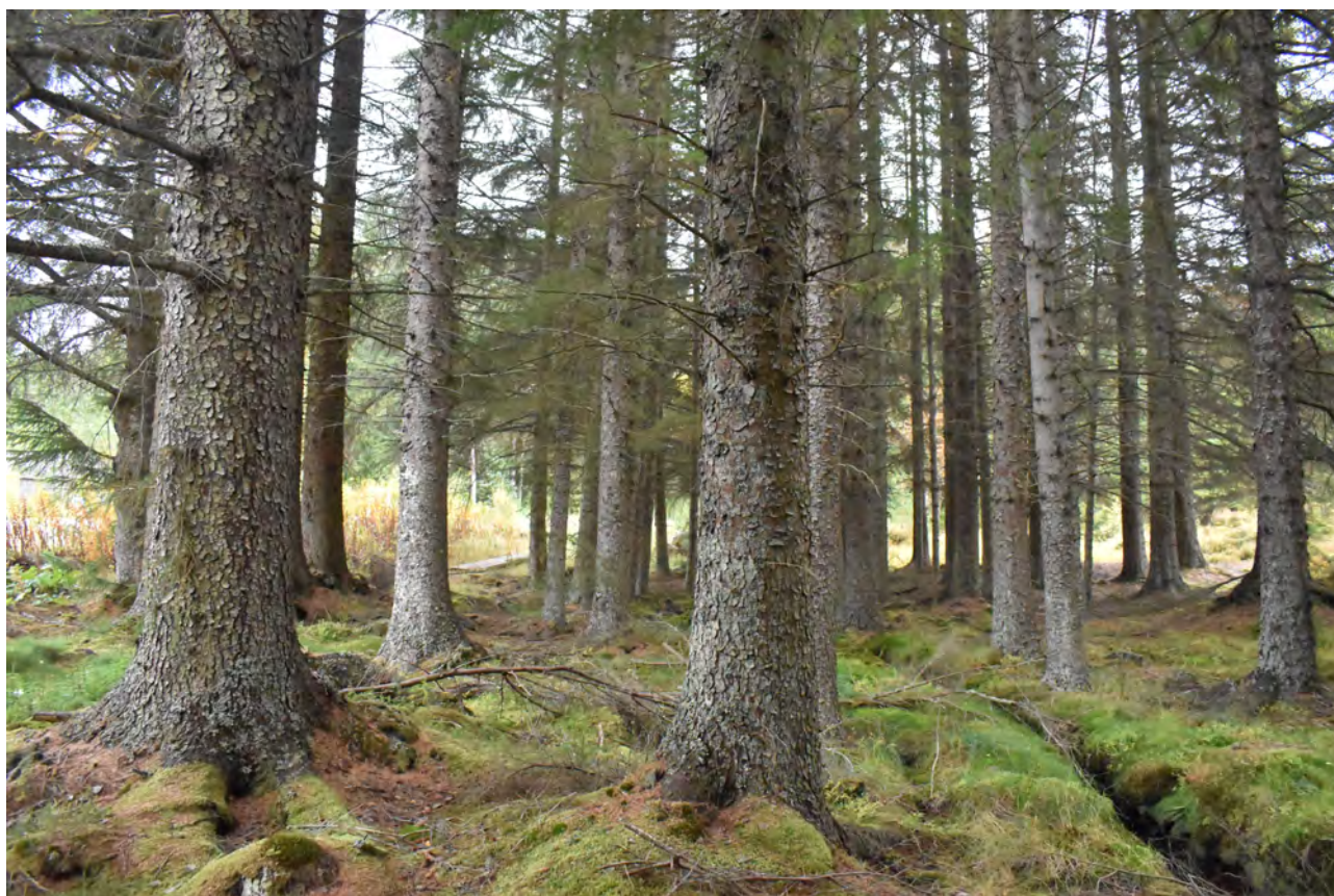
Figure 1. Sitka Spruce ( Picea sitchensis ) trial plantation from the early 20th century at Corrour Village.

Information regarding typical dimensions available are noted based on experience but it may be that individual sawmills and suppliers can supply a greater or lesser range than indicated. As a general rule, if looking for small quantities of timber it is surprising how much variety there is available. Talk to your local sawmill. A good source of information on independent sawmills is the Association of Scottish Hardwoods ( ASHS ) website.