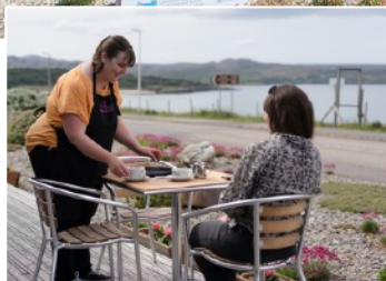
The GALE Centre community hub, Achtercairn, Gairloch, Highland Small Communities Housing Trust