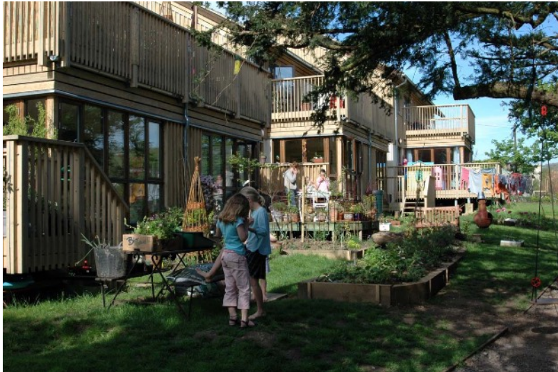
Springhill Co-housing, Stroud, Gloucestershire by Architype

In Germany, the State, in collaboration with local communities, decide where development should occur and puts in place the necessary infrastructure. The Scottish Government should consider – as highlighted by the Scottish Land Commission – the lessons to be learnt of such a model and the benefits of their application in Scotland.