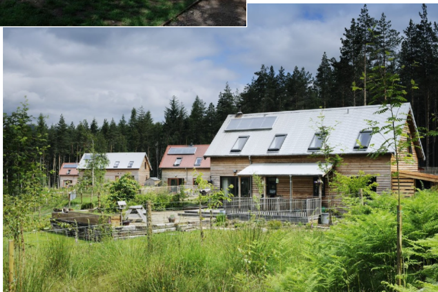
Ardgeal, Kinraig by David Somerville Architects: affordable homes built with the Highland Small Communities housing trust