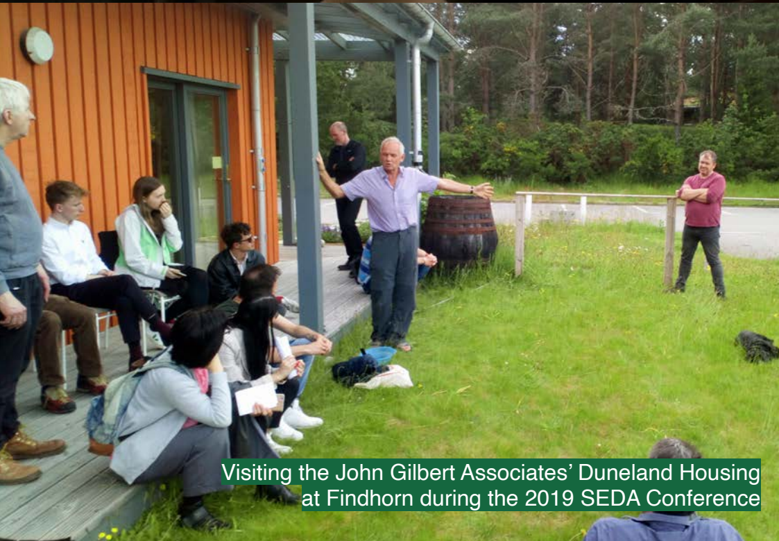
Visiting the John Gilbert Associates' Duneland Housing at Findhorn during the 2019 SEDA Conference