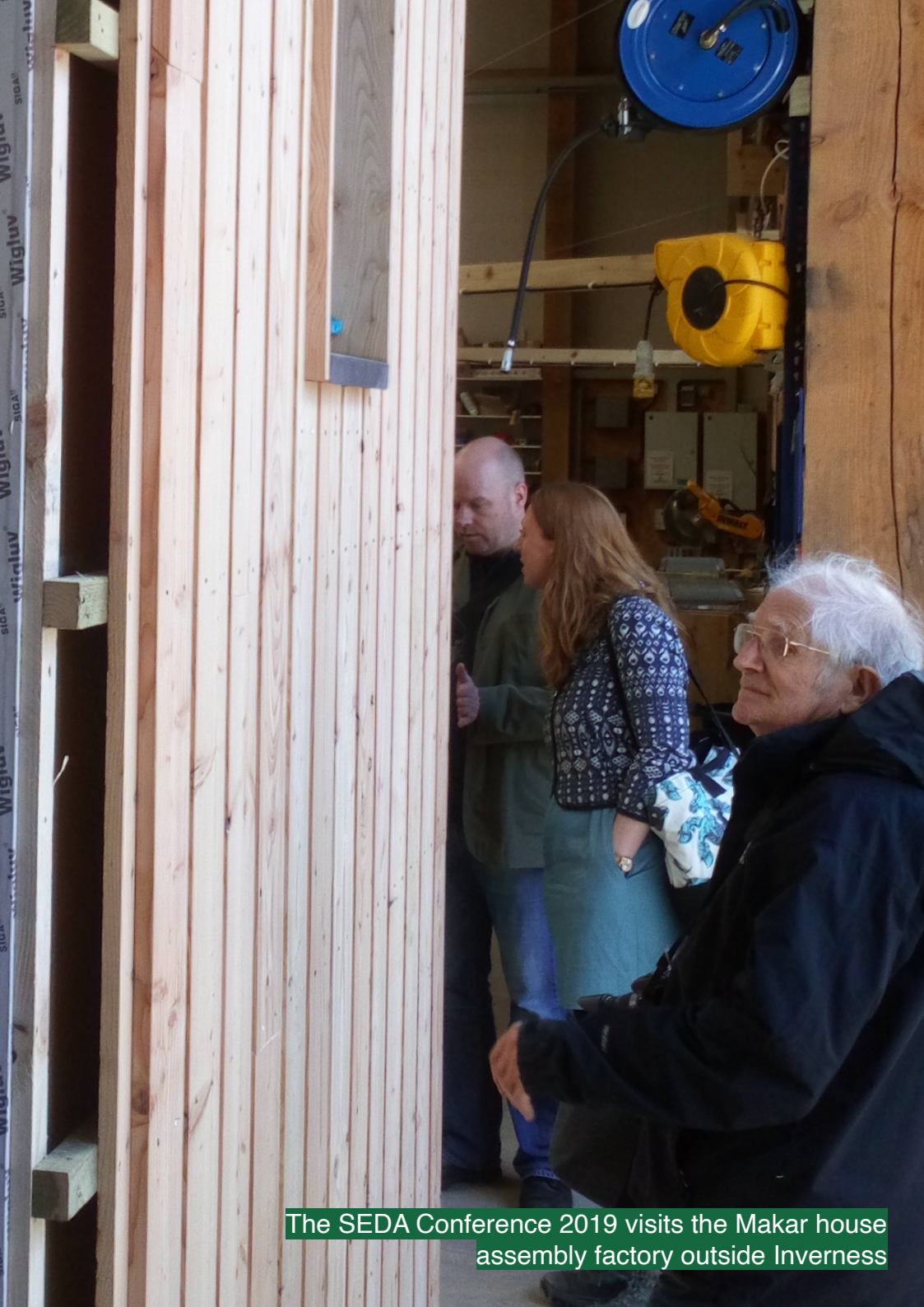
The SEDA Conference 2019 visits the Makar house assembly factory outside Inverness