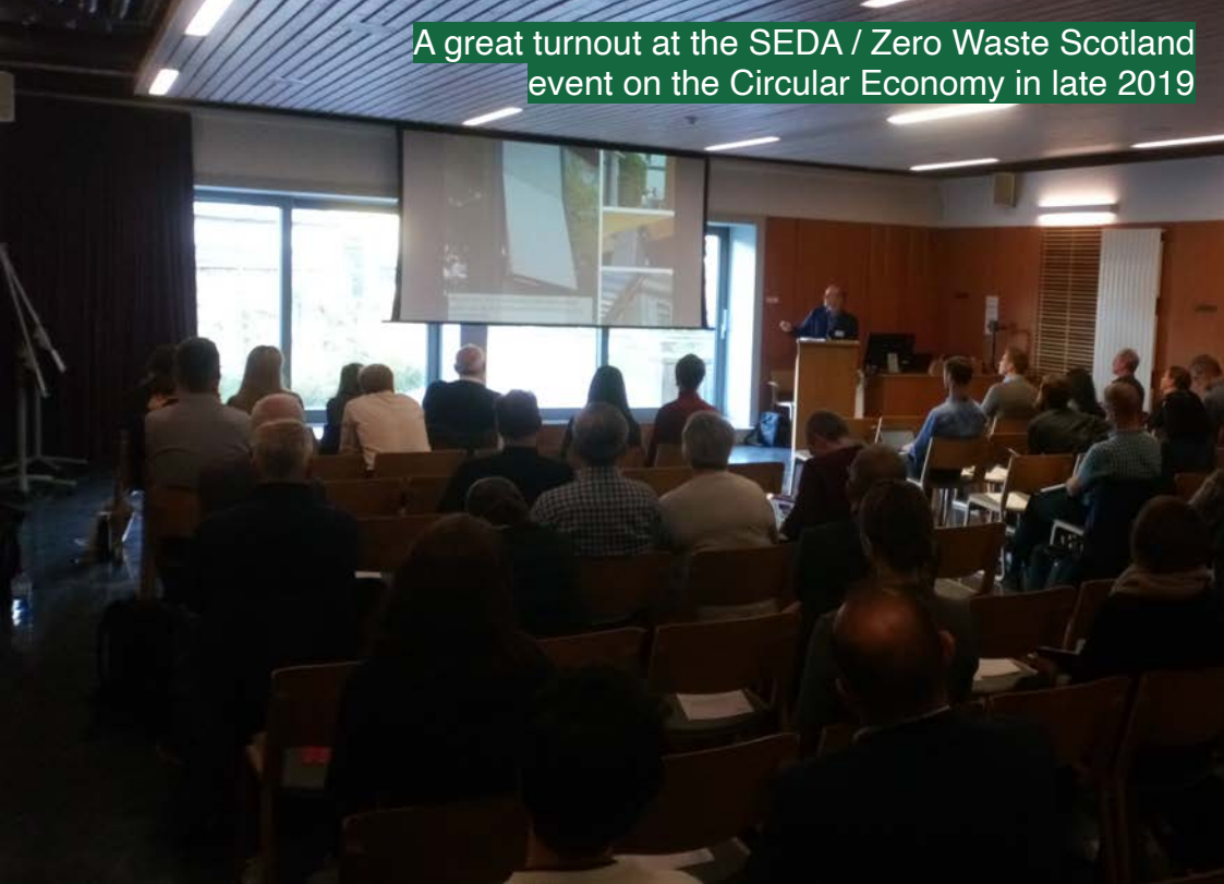
A great turnout at the SEDA / Zero Waste Scotland event on the Circular Economy in late 2019